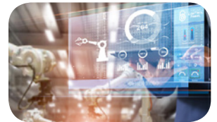
Industrial & Medical