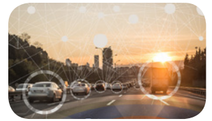
IoT/loV & Optoelectronics