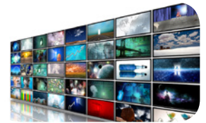
Flat Panel Display